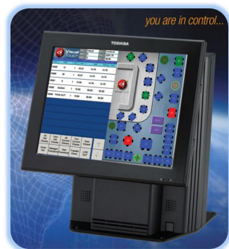
Table Service Point of Sale

VisualTouch provides the tools your senior living community needs to handle resident reservations, seating, ordering, and delivery with ease. You will be able to impress your residents with a fine dining experience that includes personalized service.